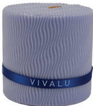
Blue Macadamia, Jojoba Oil & Soy Butter, this candle gives your senses the feeling of water & earth around you. When used in a massage you are revived & confident. 11456

These candles are rich in nutrients for skin, & are made fluid & useable by the lit flame. In addition to the natural moisturizing action of the oils, the perfume contained in the formula plays an aromatherapy role of balance.