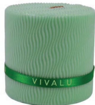
Green Juniper, Thyme, Benzoin & Cloves essential oils make up a natural, earthy candle which leaves you fresh after a relaxing massage. 11458