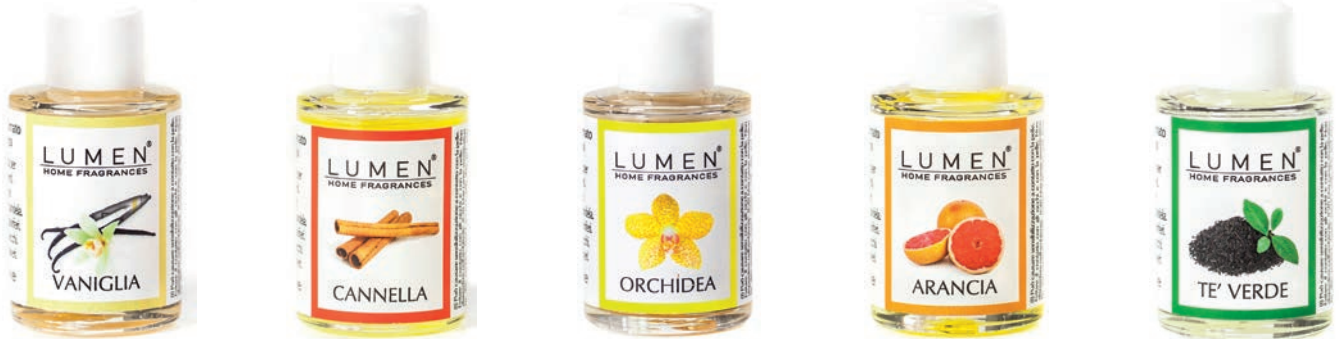
Vanilla 10876 Cinnamon 10877 Orchid 10878 Orange 10879 Green Tea 10880