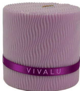
Red Rice & Bio Cartam Oil in Coconut & Shea Butter Mousse, will take your senses to a tranquil place of relaxation & meditation. 11457