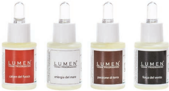
Fire (Red) 16137 Sea (White) 16138 Earth (Brown) 16139 Wind (Black) 16140