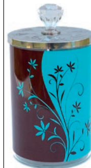
Split Personality 6609