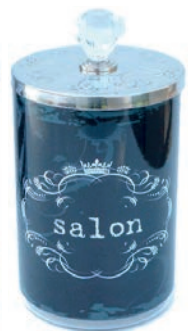
Urban Chic 6610