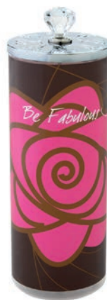
Be Fabulous 6083